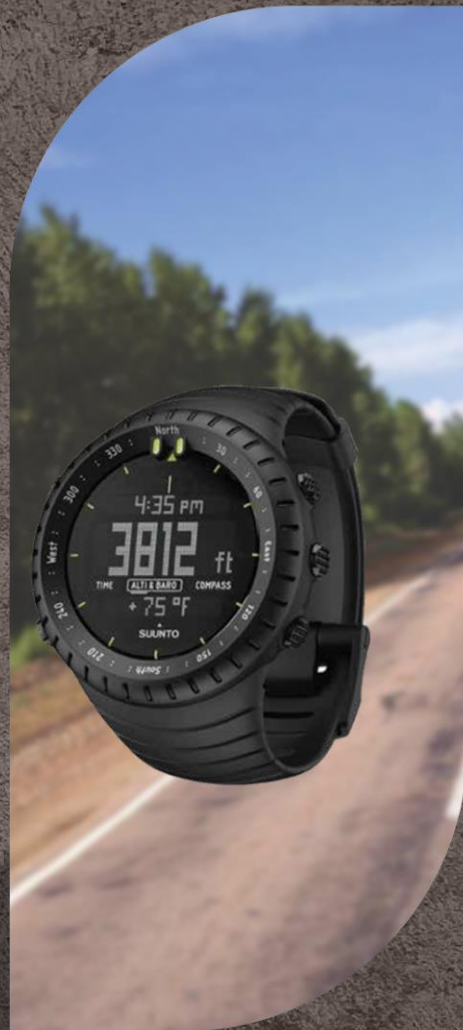
Core all black