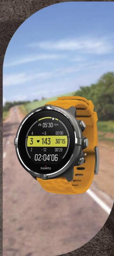
Spartan sport WHR