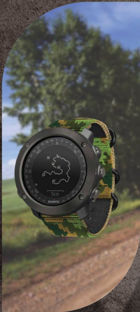
Traverse alpha woodland